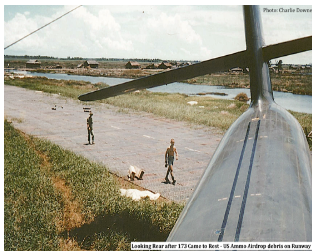
Looking rear towards runway US air drop ammo box debris still on runway Right U/C skid marks off runway

An initial assessment of the aircraft indicated that it would have to be written off and reduced to spare parts as a replacement right wing was not available. Work commenced to break the aircraft down to spares. In the main, the removed equipment included radios, instruments and electrical items. Most wiring looms were cut rather than disconnected as there was a perceived need to "get in and get out".