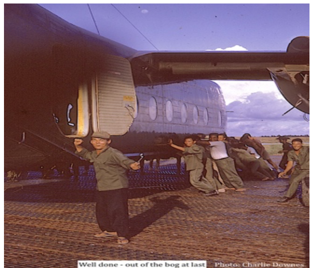
All hands needed to get it out of bog onto PSP