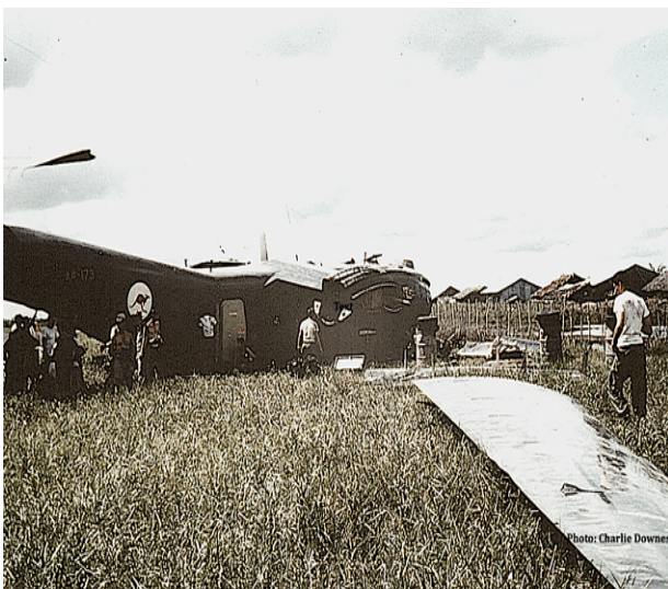
Right wing removed

There were also some US Army technicians, who mainly worked on the airframe, but helped other trades when needed. Their assistance was certainly appreciated.