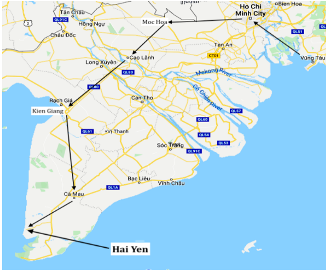
Route flown and location of Hai Yen

At 1305 on Friday 7 May 1965, RAAF Caribou A4-173, of RAAF Transport Flight Vietnam (RTFV), crashed at Hai Yen in Vietnam. Hai Yen was a small fortified settlement located on the south-western tip of the Mekong Delta, south of Ca Mau.