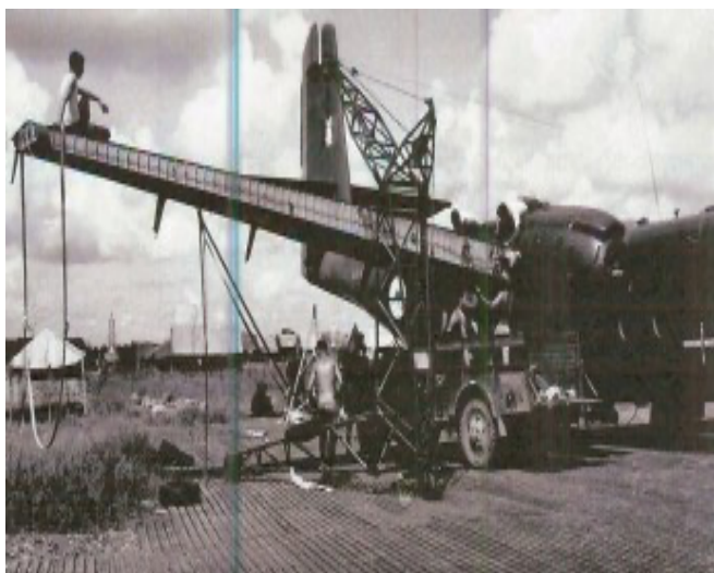
Loaned US Army wing being fitted