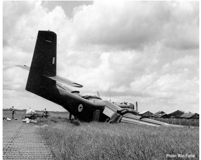
After landing at Hai Yen